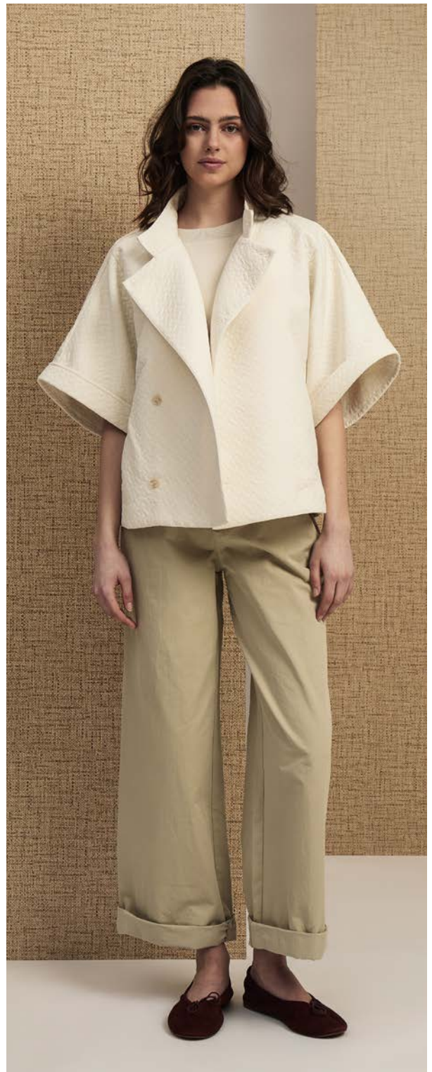
PCFiola GOTS Tee Shirt - PC8144 PCFanou Short Jacket - PC8181 PCFie Worker Pant - PC8177