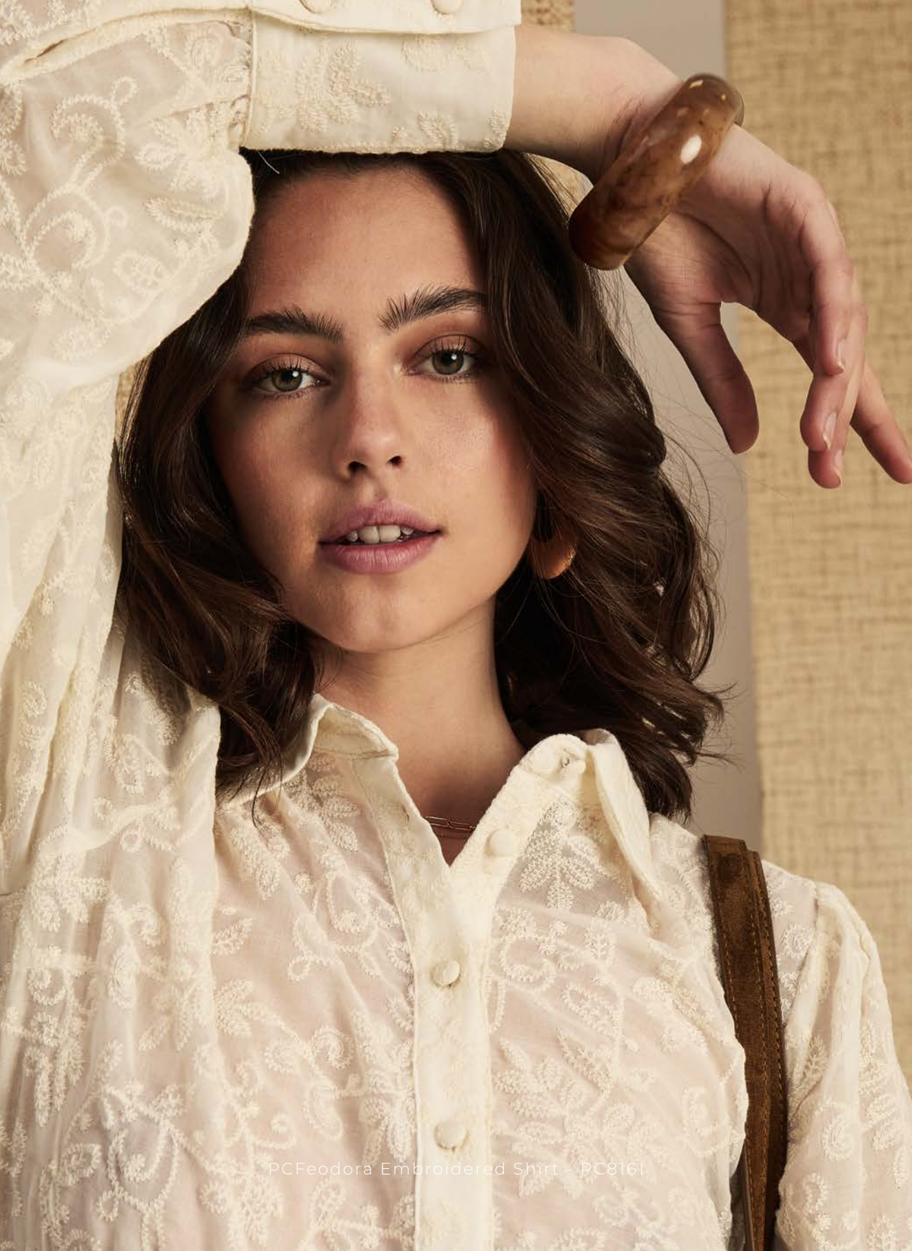
PCFeodora Embroidered Shirt - PC8161