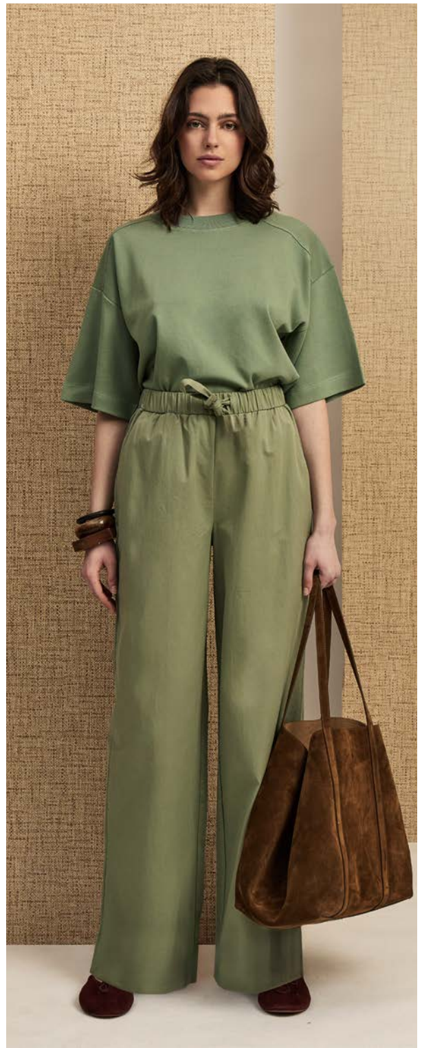
PCFiola GOTS Tee Shirt - PC8144 PCFia Belt Pant - PC8189