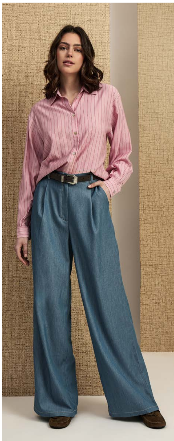
PCFelia Striped Shirt - PC8190 PCFilippa Wide Pant - PC8179