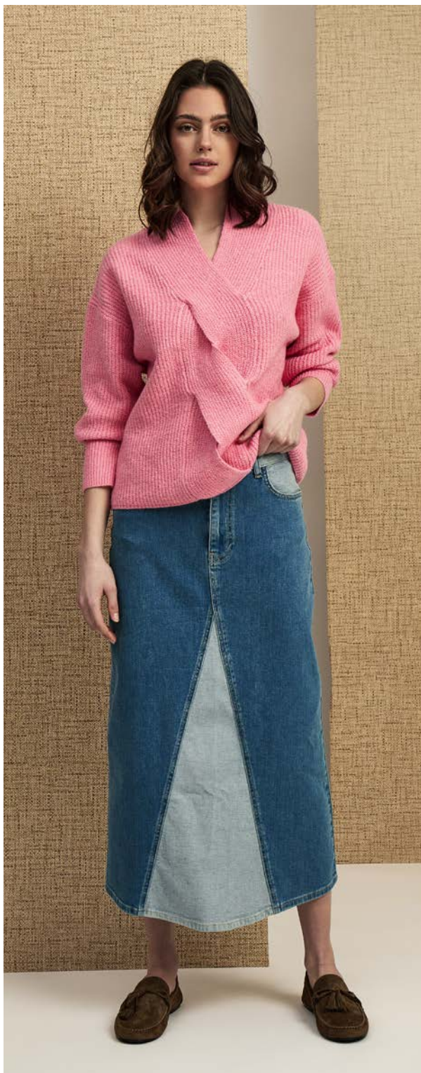
PCFeline V-Neck pullover - PC8155 PCCelia Jeans Skirt - PC8013