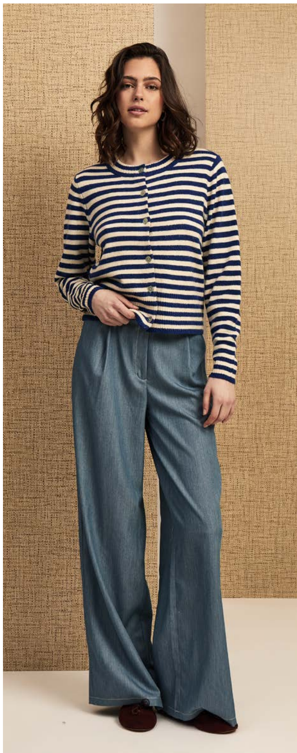
PCFabienne Short Cardigan - PC8154 PCFilippa Wide Pant - PC8179