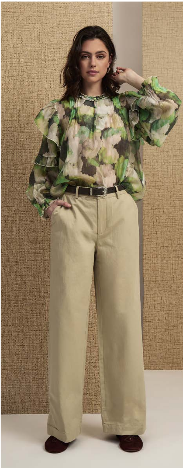
PCFleur Long Sleeve Blouse - PC8182 PCFie Worker Pant - PC8177