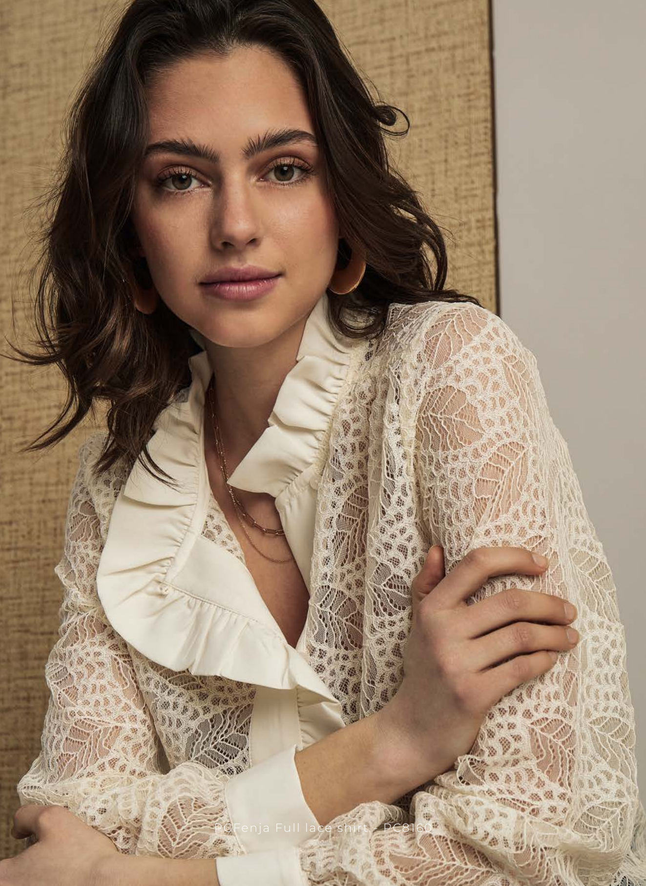
PCFenja Full lace shirt - PC8160