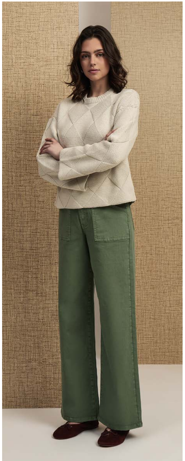
PCFay O-Neck Pullover - PC8150 PCFione Straight Jeans - PC8180