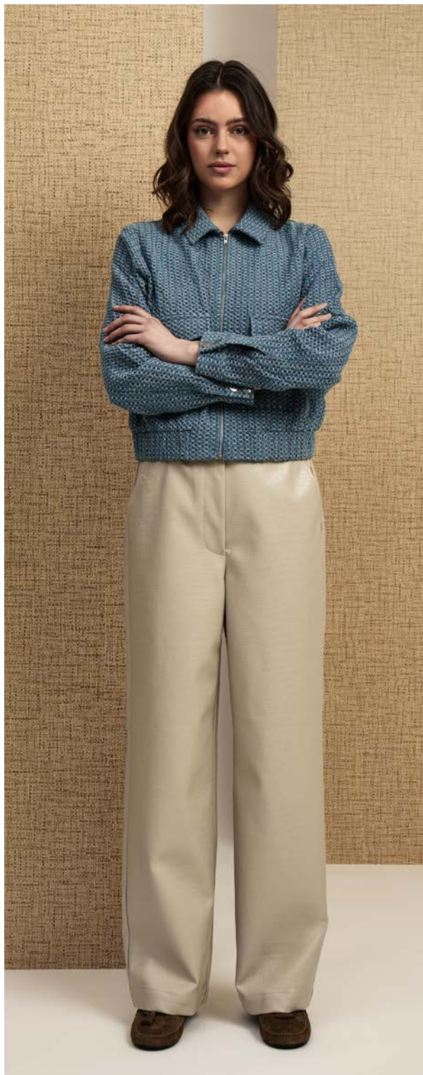
PCFanne Denim Jacket - PC8191 PCElvira Faux Leather Pant - PC8138