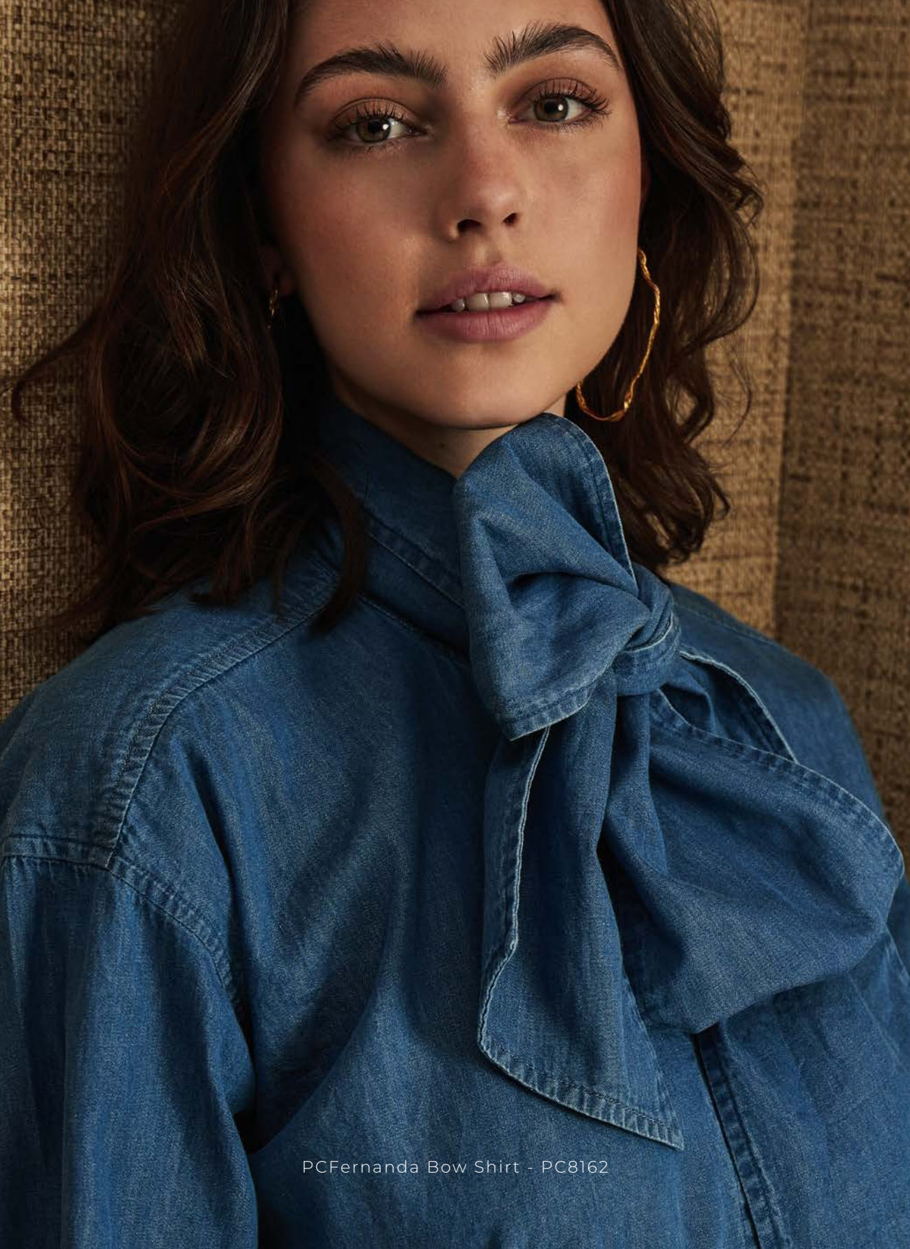
PCFernanda Bow Shirt - PC8162