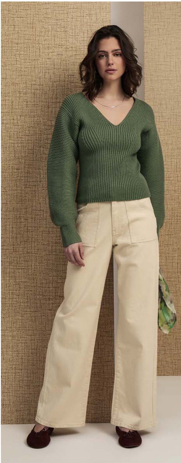
PCFemke V-Neck Pullover - PC8166 PCFione Straight Jeans - PC8180