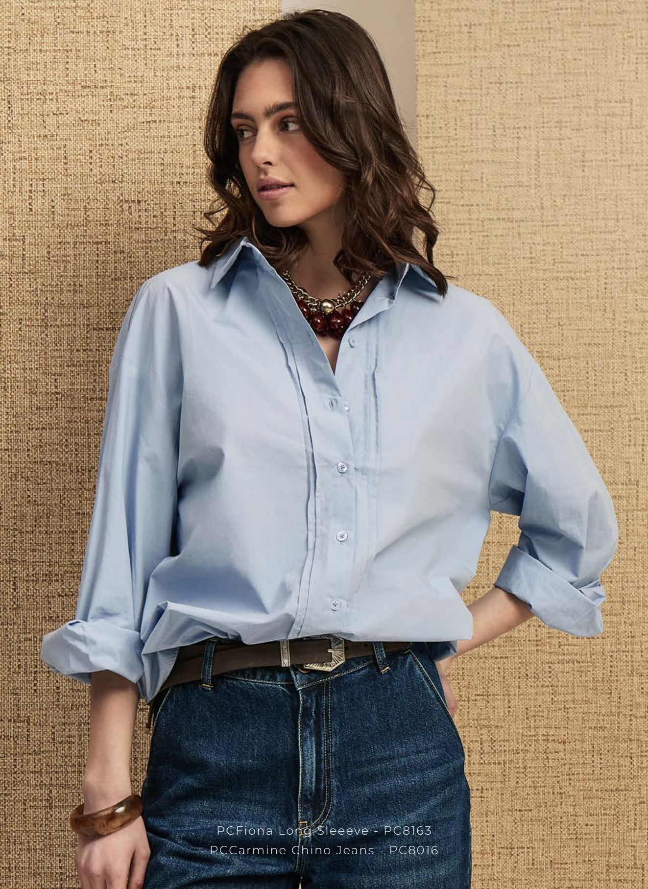
PCFiona Long Sleeve - PC8163 PCCarmine Chino Jeans - PC8016