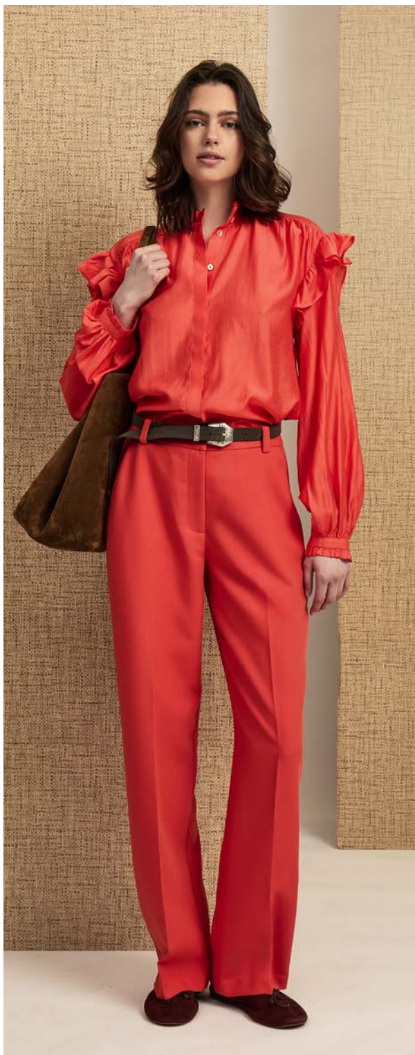
PCFallula Wide Sleeve Shirt - PC8195 PCDelia Mid Waisted Straight Pant - PC8122