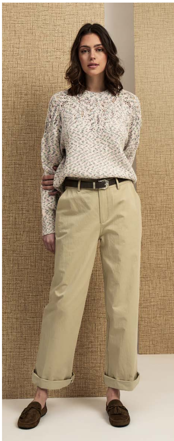
PCFabrina Raglan Sleeve pullover - PC8153 PCFie Worker Pant - PC8177