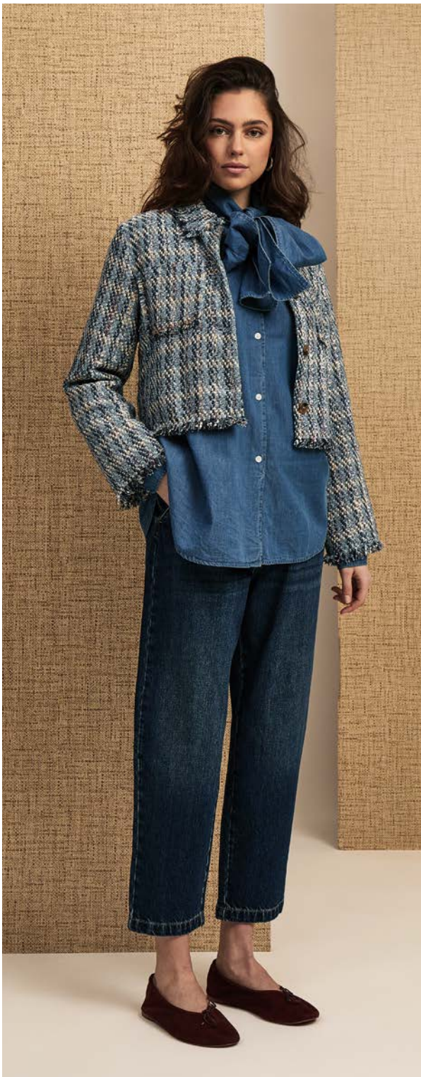
PCFrancie Short Jacket - PC8185 PCFernanda Bow Shirt - PC8162 PCCarmine Chino Jeans - PC8016