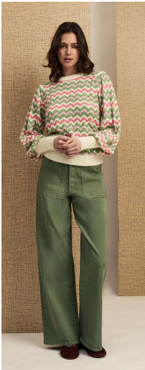
PCFilicia O-Neck Pullover - PC8234 PCFione Straight Jeans - PC8180