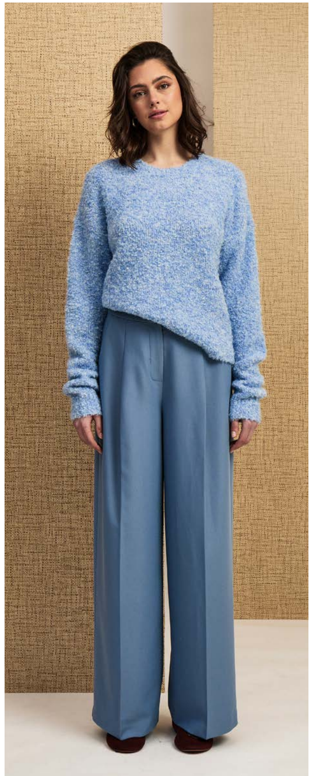
PCCoral pullover - PC8087 PCTashia Wide Pant - Pc7844