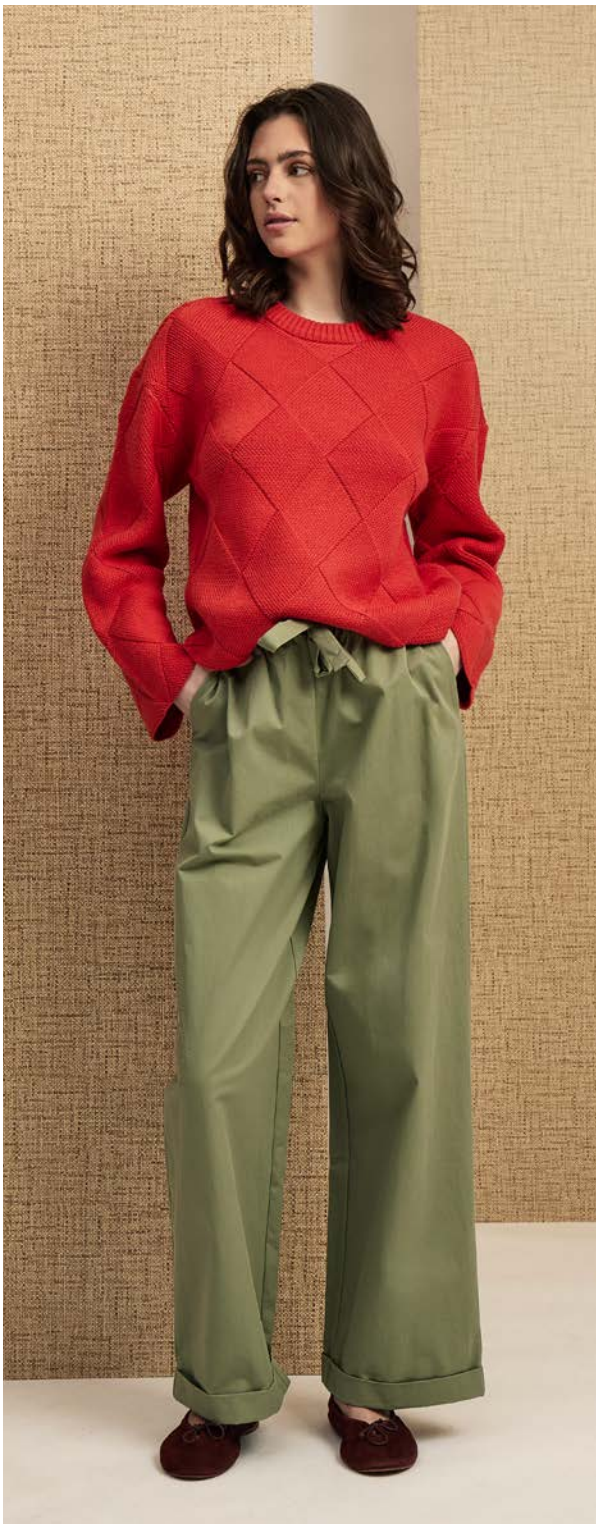
PCFay O-Neck Pullover - PC8150 PCFia Belt Pant - PC8189