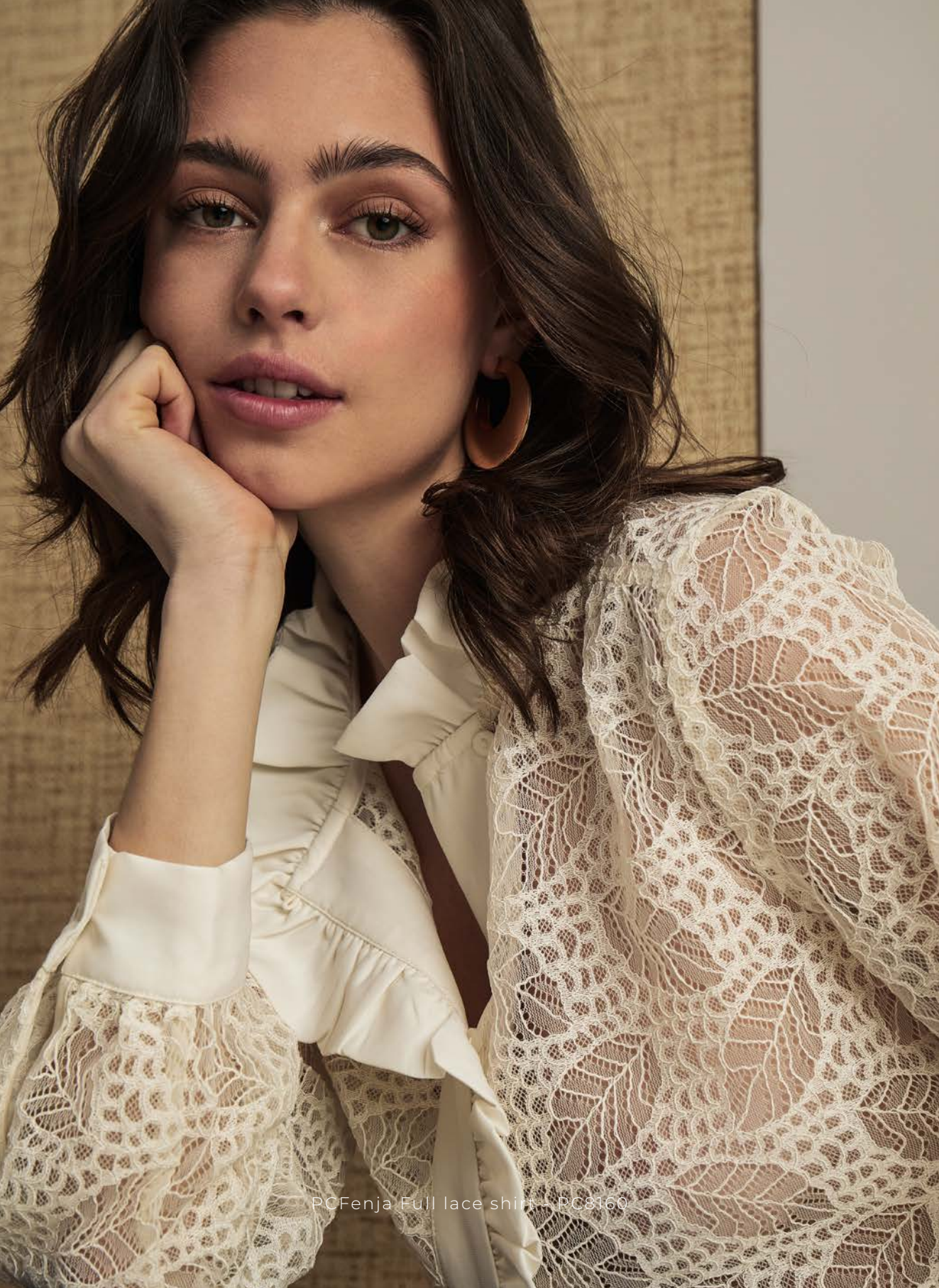
PCFenja Full lace shirt - PC8160