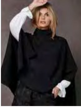
8201-40: XATE BLOUSE 8231-10: XINYAN TROUSERS 8240-60: XIAO PONCHO KNIT