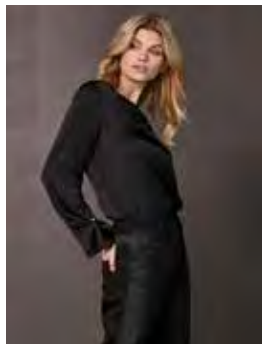
8200-40: XIA BLOUSE 8217-10: XAVIA TROUSERS