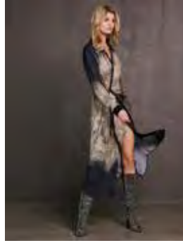
8211-23: XANIA DRESS