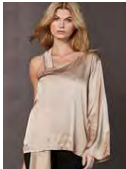
8200-42: XIA BLOUSE TIE STRAP