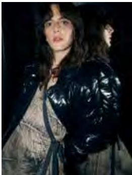
8211-23: XANIA DRESS 8215-37: XUKE BIKERJACKET OVERSIZE