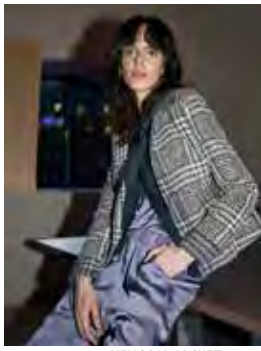
8234-40: XENOBIA JACKET 8224-30: XANTIA JACKET 8200-40: XIA BLOUSE 8200-10: XIA TROUSERS