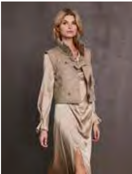
8212-33: XELIA VEST 8200-26: XIA DRESS