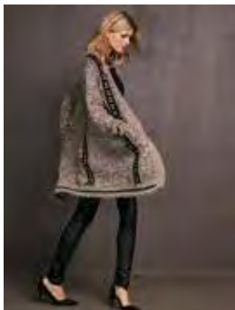
8220-40: XANTAL BLOUSE RECYCLED 8239-60: XIN CARDIGAN LONG KNIT 7376-19: MILJA LEGGINGS