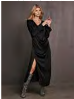
8200-26: XIA DRESS