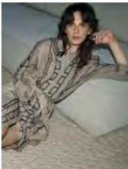
8209-23: XENI DRESS