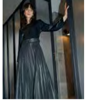
8207-23: XANA DRESS