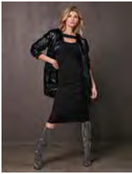
8215-35: XUKE JACKET LONG 8240-23: XIAO DRESS KNIT