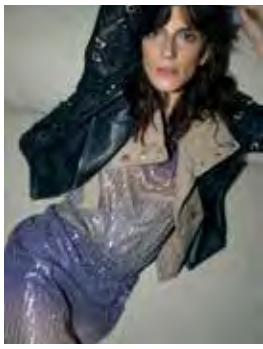
8205-35: XINA JACKET 8212-33: XELIA VEST 8208-46: XUE TOP 8208-20: XUE SKIRT