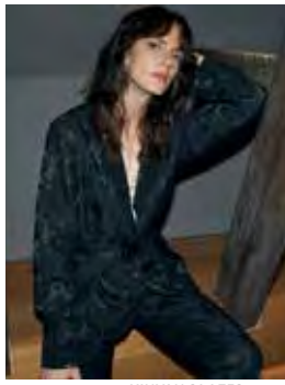
8231-35: XINYAN BLAZER 8231-10: XINYAN TROUSERS