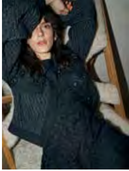
8218-35: XANDRA JACKET 8218-23: XANDRA DRESS