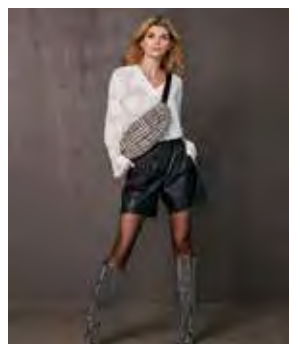
8213-40: XUZI BLOUSE 8234-80: XENOBIA BAG 88216-15: XARA SHORTS