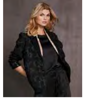
8231-35: XINYAN BLAZER 8200-40: XIA BLOUSE 8200-10: XIA TROUSERS