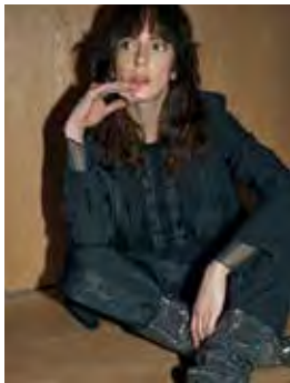
8220-42: XANTAL BLOUSE RECYCLED 8217-35: XAVIA BLAZER 8217-11: XAVIA TROUSERS