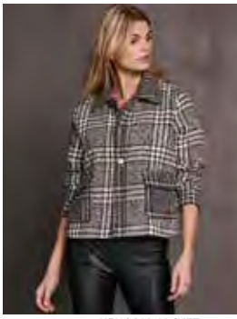
8234-40: XENOBIA JACKET 7376-19: MILJA LEGGINGS