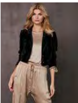
233-36: XING BLAZER SHORT 88200-40: XIA BLOUSE 8200-10: XIA TROUSERS