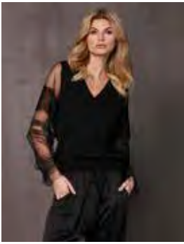
8242-40: XYRIENNE BLOUSE KNIT 8200-10: XIA TROUSERS