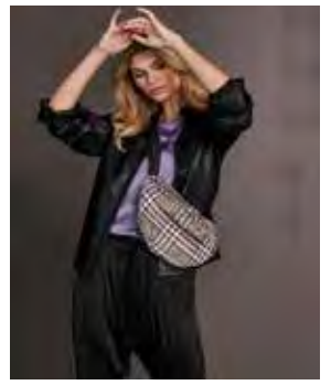
8216-40: XARA SHIRT 8200-40: XIA BLOUSE 8234-80: XENOBIA BAG 8200-10: XIA TROUSERS