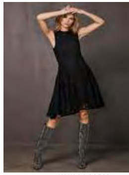
8218-23: XANDRA DRESS