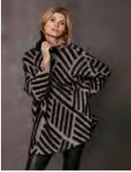
8243-60: XIU PULLOVER KNIT 7376-19: MILJA LEGGINGS