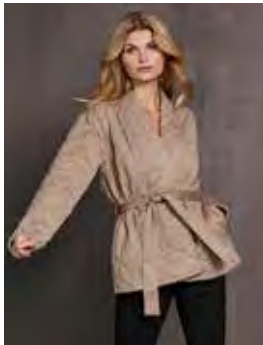
8212-35: XELIA JACKET 7380-19: MARLEY LEGGINGS