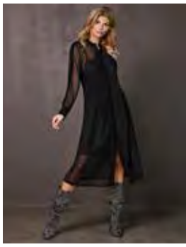
8220-23: XANTAL DRESS RECYCLED