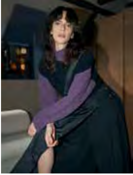
8203-60: XELA PULLOVER KNIT 8216-80: XARA BAG 8217-20: XAVIA SKIRT