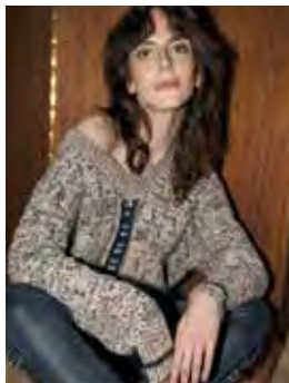
8239-65: XIN BLOUSE KNIT 8207-10: XANA TROUSERS