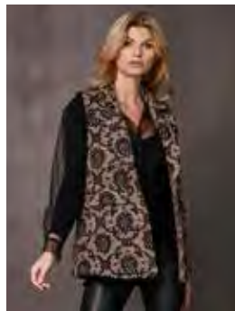
8242-46: XYRIENNE BLOUSE KNIT W/ MESH SHIRT 8204-33: XELINA VEST 7376-19: MILJA LEGGINGS