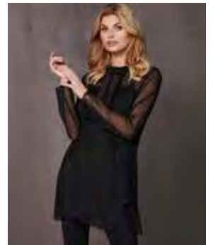
8220-26: XANTAL TUNIC RECYCLED 8230-19: XARINA LEGGINGS