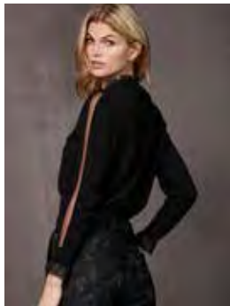
8242-44: XYRIENNE BLOUSE KNIT 8231-10: XINYAN TROUSERS