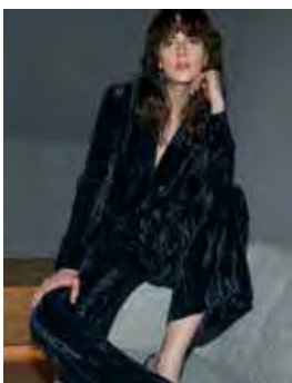
8233-35: XING BLAZER LONG 8233-10: ING TROUSERS