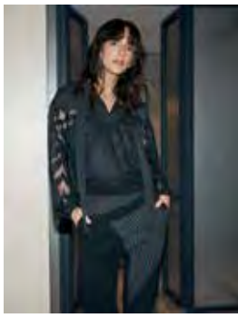
8219-40: XEMINA BLOUSE 8218-10: XANDRA TROUSERS