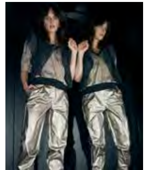
8207-33: XANIA BLOUSE 8207-33: XANA VEST 8229-10: XUELE TROUSERS