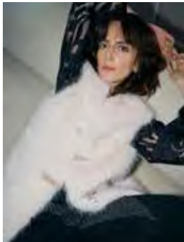
8219-40: XEMINA BLOUSE 8228-33: XUKE VEST 8218-10: XANDRA TROUSERS