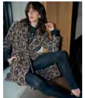
8218-46: XANDRA TOP 8204-30: XELINA JACKET 8230-19: XARINA LEGGINGS