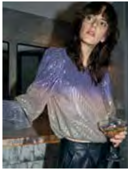
8208-50: XUE BLOUSE 8216-15: XARA SHORTS