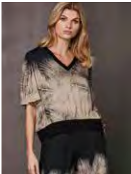
8207-33: XANIA BLOUSE 8211-10: XANIA TROUSERS