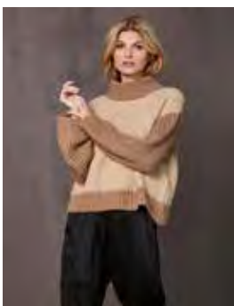
8203-60: XELA PULLOVER KNIT 8200-10: XIA TROUSERS