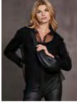
8242-46: XYRIENNE BLOUSE KNIT W/ MESH SHIRT 8216-80: XARA BAG 7376-19: MILJA LEGGINGS