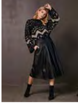
8243-50: XIU BLOUSE KNIT 8205-20: XINA SKIRT