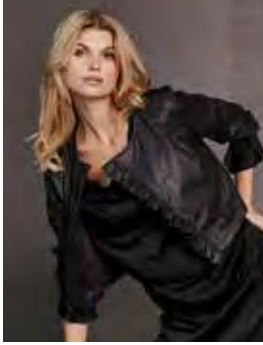
8207-30: XANA JACKET 8200-26: XIA DRESS