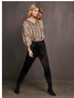
8209-40: XENI SHIRT 8200-10: XIA TROUSERS