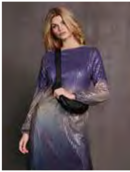
8208-26: XUE DRESS 8216-80: XARA BAG