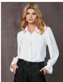
8201-40: XATE BLOUSE 8231-10: XINYAN TROUSERS