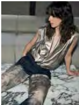
8229-33: XUELE VEST 8211-10: XANIA TROUSERS