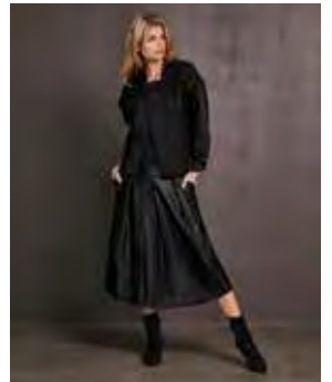
8224-30: XANTIA JACKET 8205-20: XINA SKIRT